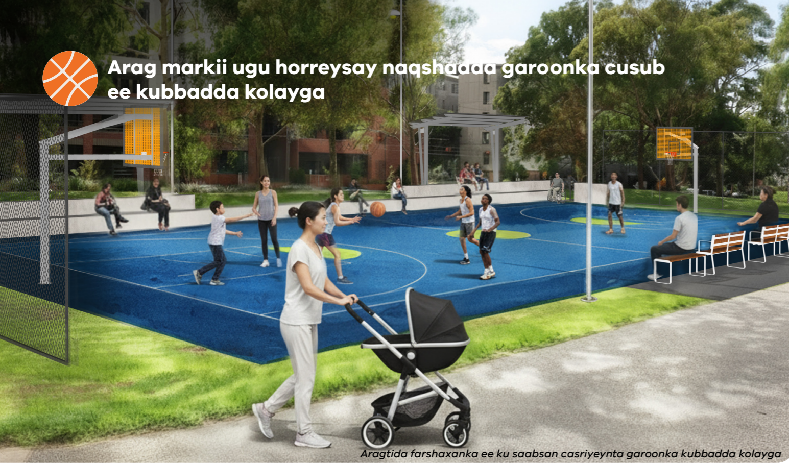
Aragtida farshaxanka ee ku saabsan casriyeynta garoonka kubbadda kolayga

Naqshadahan waxaa lagu saleeyay la tashi lala sameeyay Xarunta Dhalinyarada ee Richmond waxayna ka dhigaysaa barxada mid casriyeysan oo lagu ciyaari karo isla markaasna ammaan ah ayna dad badan heli karaan si ay ugu baashaalaan.