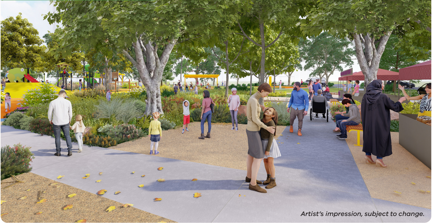
Artist's impression, subject to change.