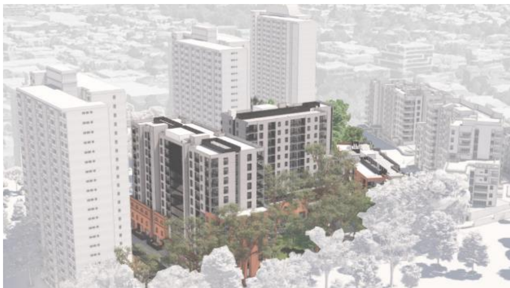
Artist's impression of the Holland Court, Flemington

Homes Victoria, together with project partner Building Communities, is redeveloping the Holland Court, Flemington housing site to provide 286 social and affordable homes that are modern, accessible, and sustainable as well as a large new public park. The builder at the site is ICON.